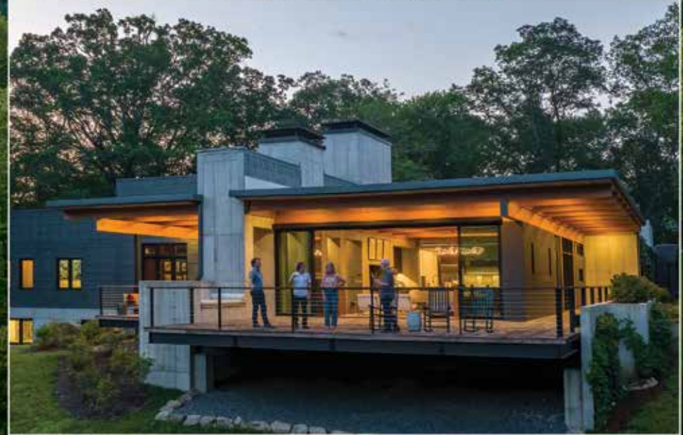
See inside this beautiful Cashiers, North Carolina home at ccrarchitecture.com